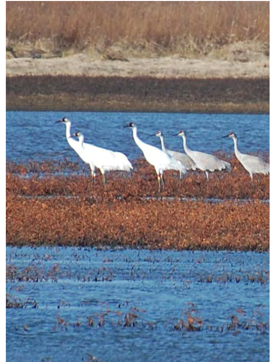
Whooping Cranes and Sandhill Cranes at Point Pleasant, 2011 (Dan McHale)

To Donate Online: https://forest-preserve-friends-foundation.networkforgood.com/projects/56735-point-pleasant-triple-match-challenge