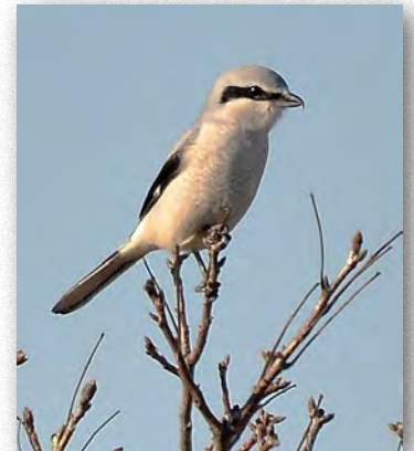
Northern Shrike

Middle Fork had a Pintail Duck. Tree Sparrows are back and a late Chipping Sparrow was seen at Middle Fork.