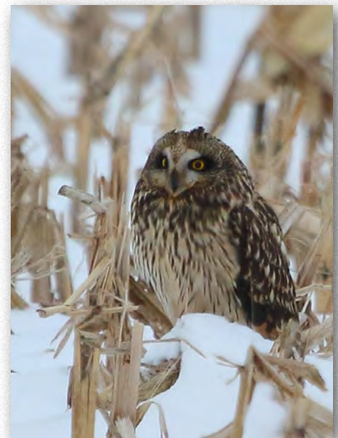
Short-eared Owl

This is an unfair tally because the total for any area depends on how often birders cover it. Busey/Crystal Lake is visited each week in spring and fall on our Sunday morning bird walks. These will start again on the first Sunday in March. I’m sure that numbers for the Middle Fork Preserve would go up with more visits by observers.