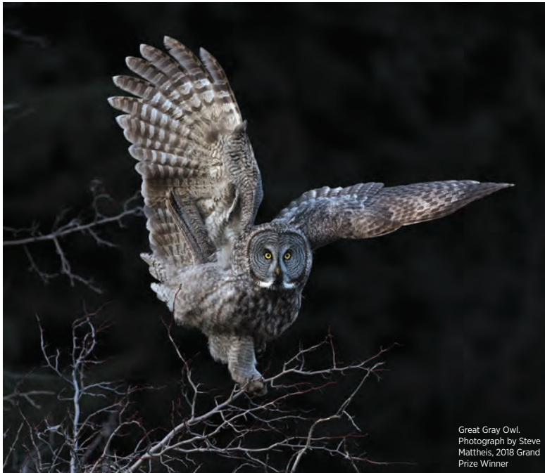
Great Gray Owl.

Today's best bird photography is a portal into the natural world, and these images from the Audubon Photography Awards will inspire and inform you. The twelve images on display were chosen from nearly 8,000 images submitted to the National Audubon Society in 2018 in the Amateur, Professional, and Youth categories.