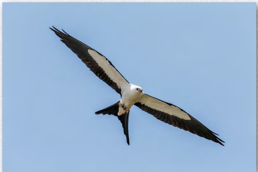
Swallow-tailed Kite

Twelve Eurasian Collared Doves near Homer on September 15.