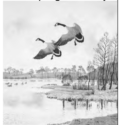
drawing by Charles Tunnicliffe from Mereside Chronicle (1948)

Birds of the Middle Fork Forest Preserve in Champaign County