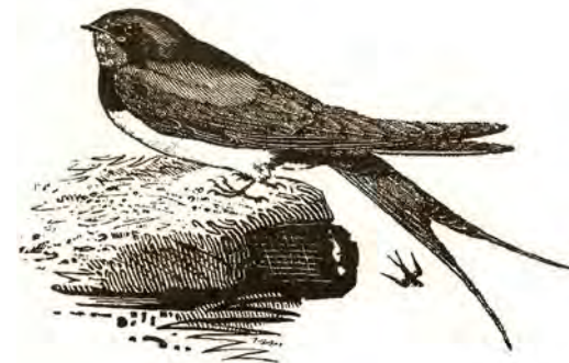
"The Swallow " Wood engraving by Thomas Bewick from A History of British Birds (1797)

Watching begins at 6 pm Potluck at 6:30 pm