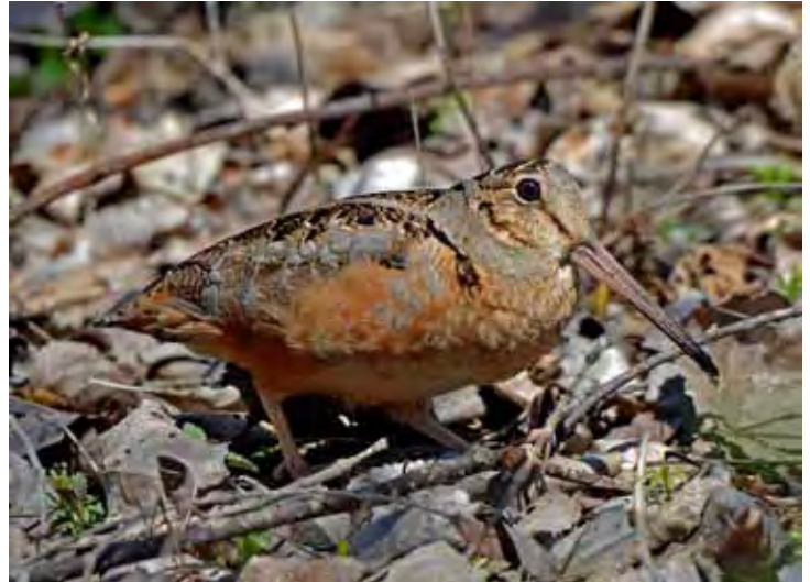
Rodney Campbell ©2015 This work is licensed under the Creative Commons Attribution 4.0 International License. To view a copy of this license, visit http://creativecommons.org/licenses/by/4.0/ . No modifications.

Sat, Mar. 19, 7-8pm Interpretive Center, Homer Lake Forest Preserve. A short presentation will be followed by a hike to look for the sky dancers. Registration: (217) 896-2455 or cwalsh@ccfpd.org