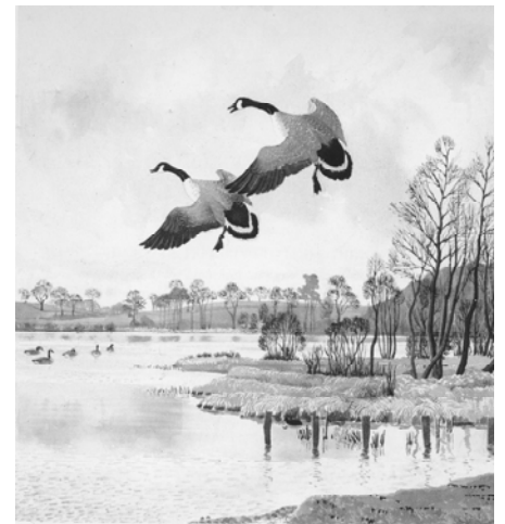
drawing by Charles Tunnicliffe from Mereside Chronicle (1948)

SEPTEMBER POTLUCK at the Izaak Walton Cabin at Lake of the Woods Thursday, September 1 6:30 PM