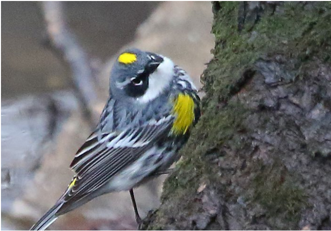
Yellow-rumped Warbler.

Most unusual birds: White-fronted Goose and Harris' Sparrow (The well-photographed sparrow was in a backyard).