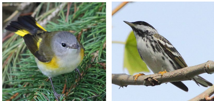
Eurasian Collared Dove (top), American Redstart (lower left), Blackpoll Warbler.