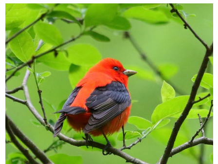
Clockwise from top left: Baltimore Oriole, Prairie Warbler, Scarlet Tanager, and Carolina Wren.