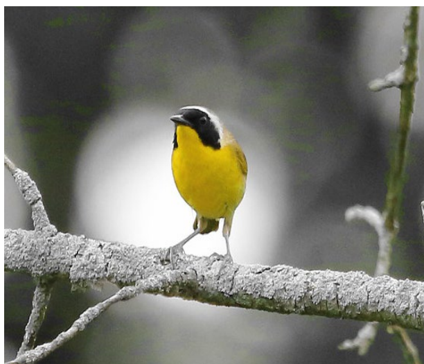
Common Yellowthroat.

The period of time between when a young songbird leaves its nest (fledges) and leaves the territory where it was hatched (disperses) is very risky. “Mortality rates are greatest directly after leaving the nest,” Sarah explains, and so “fledglings often need to use different habitats than those used by adults [to benefit from] greater physical cover from predators and the elements.” Little is known about the post-fledging ecology of the Eastern Whip-poor-will, a species that lays its eggs directly on the ground and cares for its young for up to three weeks after they fledge. The species is declining, and so Sarah will radio-tag whip-poor-will fledglings to better understand their survival rates and habitat use to inform habitat conservation efforts.