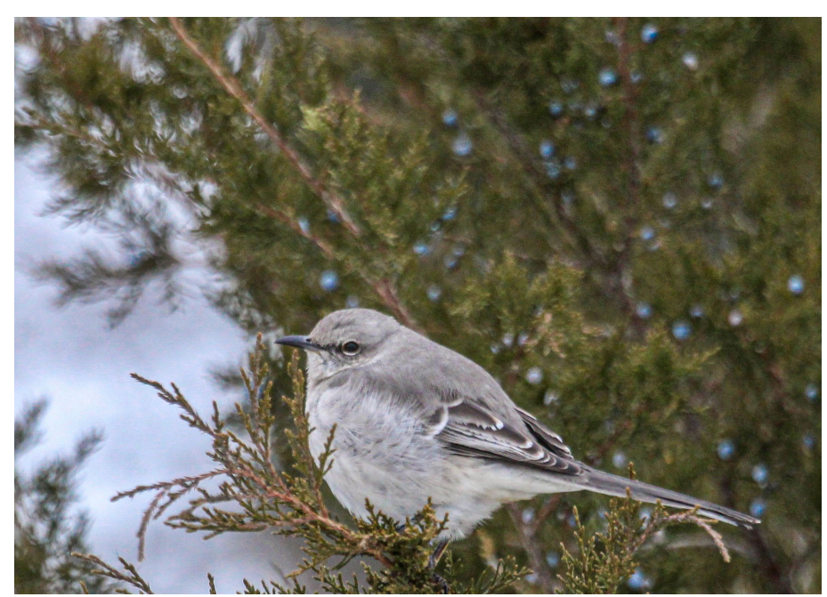
Northern Mockingbird.

We saw a Snow Goose/ White-fronted Goose hybrid, flocks of Common Goldeneyes, Common and Hooded Mergansers, and many Bald Eagles. A ruddy duck even made several brief appearances between long dives under the water. We searched for Eurasian Tree Sparrows and Common Redpolls, which have been frequent to the area this winter, but with no luck. No field trips are planned yet, but Sunday Morning Bird Walks will be back before we know it!