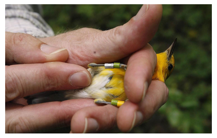
Warbler in hand.