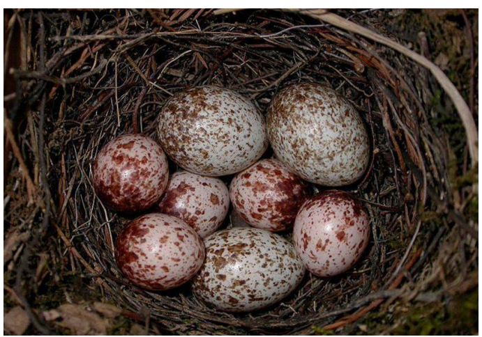
Parasitized warbler nest.