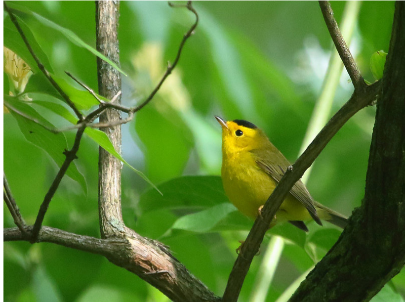
Wilson's Warbler.