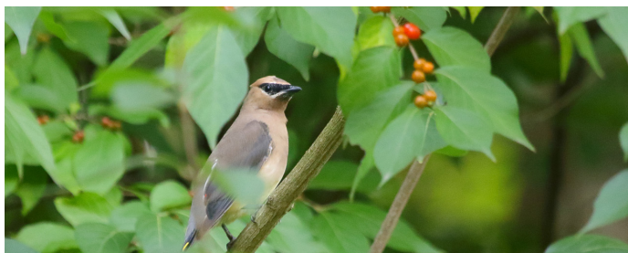
Cedar Waxwing.