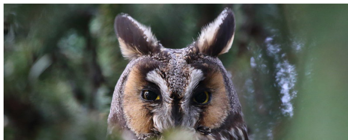
Long-eared Owl

Learn what you can do to help conserve these unique species. Recommended for ages 5 and up. FREE. Current public health guidelines will be followed. Program may be canceled due to weather or COVID-19 related concerns. For more info: (217) 896-2455 or jwick@ccfpd.org .