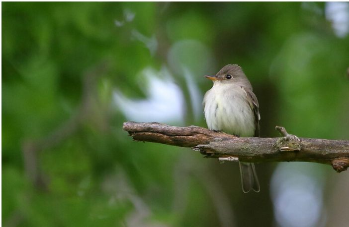
Eastern Wood Peewee.

Bold indicates contribution beyond dues.