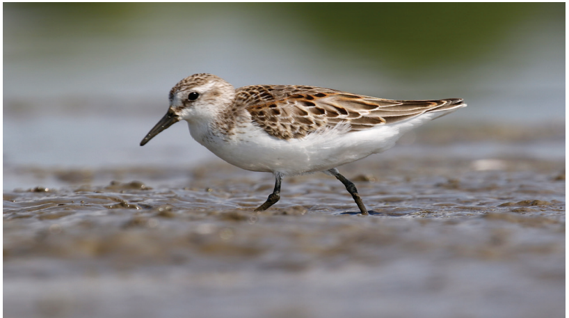
Western Sandpiper.

Join us for a day of birding in Havana. We will look for warblers and other migrants early on, then focus on ducks, shorebirds, and other birds for the rest of the day. At least 100 species of birds are possible! Colin Dobson will be leading this trip and we'll be carpooling or following Colin for the day! No pre-registration required. Hope to see you there!