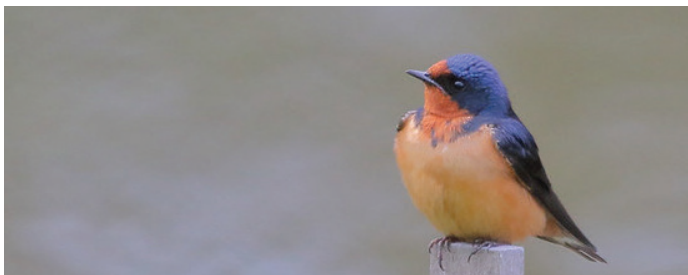
Barn Swallow.