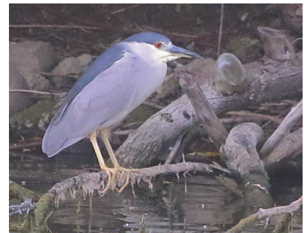
Left to Right: Yellow-Crowned Night Heron and Green Heron, Juvenile Black-Crowned Night Heron, and Adult Black-Crowned Night Heron.