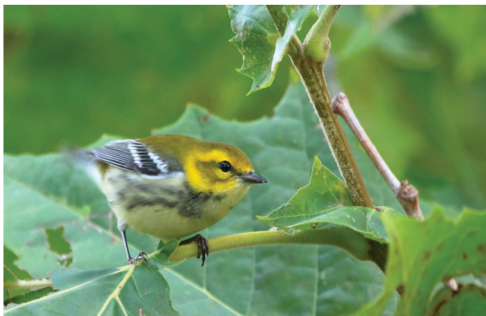
Black Throated Green Warbler.

Allan Penwell Bold indicates contribution beyond dues.