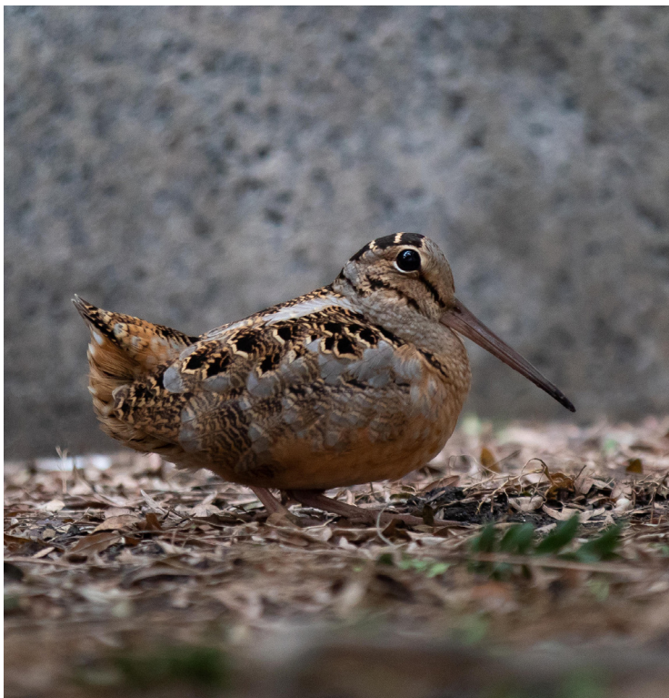
American Woodcock.