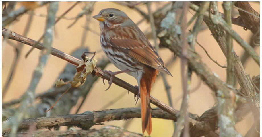
Fox Sparrow.

During the snowy, windy, and bitterly cold days, it is nice to know we are not alone in doing what we can to hunker down and wait for better and easier days ahead. 🐦