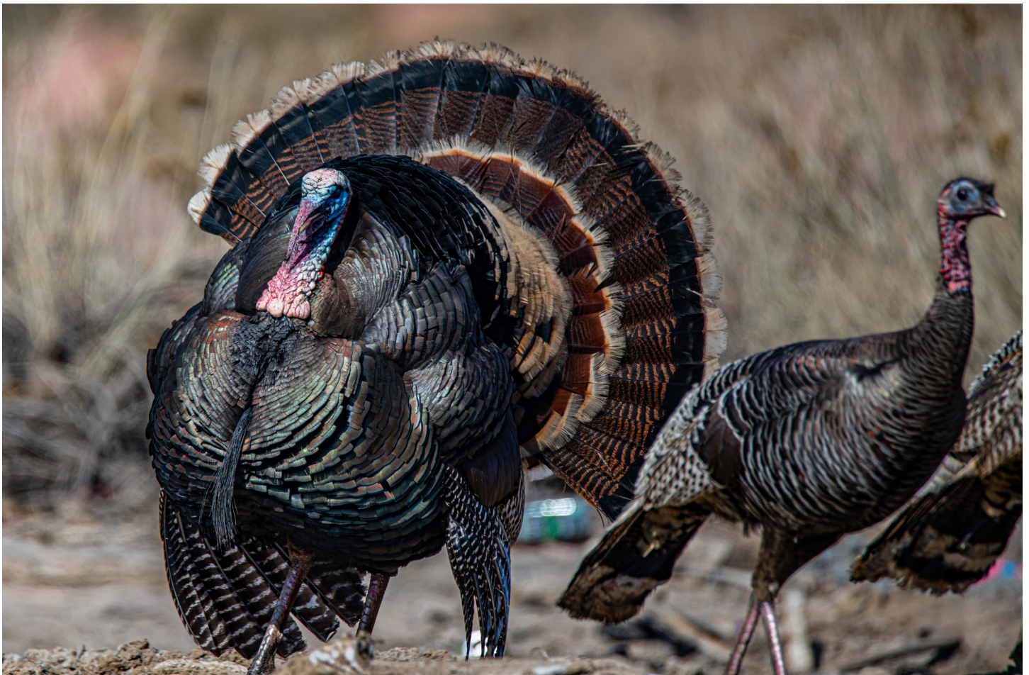
Wild Turkeys.