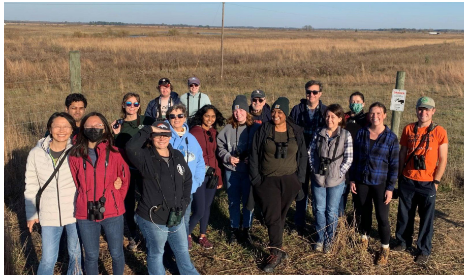
CCAS members at Kankakee Sands.