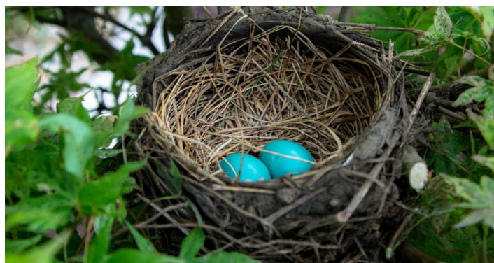
Nest with eggs.