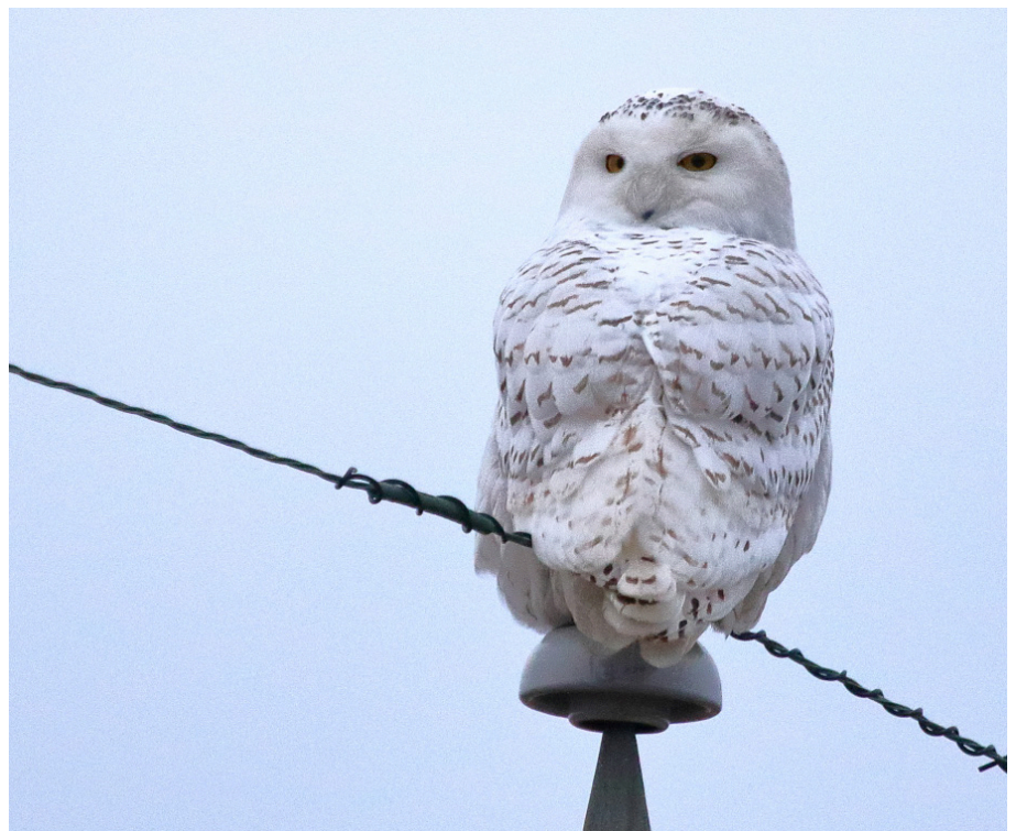
A Snowy Owl was sighted in and around Sidney, IL, this winter, causing much excitement among Champaign County birders.

This has been a good year for winter visitors. Owls have been a feature: A Snowy Owl hung around in the southeast part of the county; two, or maybe three, Northern Saw-whet Owls were at Homer Lake in exactly the same cedar trees as last year. The Great Horned Owls are beginning to nest. Red-breasted Nuthatches are visiting feeders. Purple Finches and Pine Siskins have been reported. This is a sign that the food crop is scarce up north. Cackling Geese have also been spotted among the large flocks of Canada Geese. 🦉