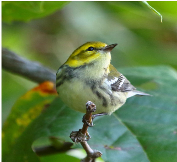
Black-throated Green Warbler in Sep. 2020.

www.champaigncountyaudubon.org/sunday-morning-birdwalks/