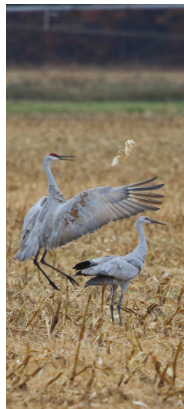
Sandhill Cranes at Jasper-Pulaski.

Each year we look forward to seeing thousands of cranes at the Jasper-Pulaski Fish and Wildlife Area in Indiana during their autumn migration. Save the date for a field trip currently in the works.