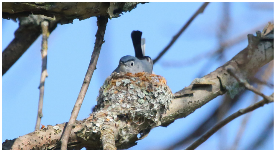
Nesting Blue-gray Gnatcatcher in Crystal Lake Park in 2016.

Stay tuned for next month's newsletter, detailing all the great finds during our Emiquon field trip, and I look forward to seeing many of you again as we resume our Fall Sunday Morning Bird Walks shortly. 🐦